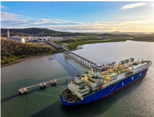
Figure 1 - the GLNG Facility on Curtis Island.

The facility and the entire gas supply chain from well to customer is illustrated in Figures 1 and 2.