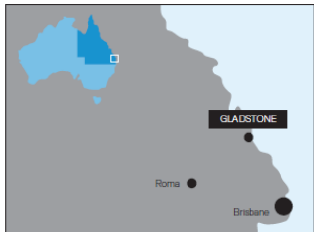
Figure 3 - locality map.

Detailed assessments conducted during the design and construction of the facility shows that possible Major Incidents are not expected to cause any immediate impact beyond the GLNG Facility boundary.